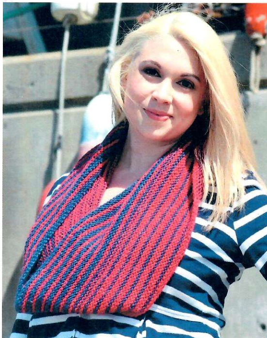
Large size shown in Simplinatural : MC (#51-Raffi) & CC (#128-Strawberry Rhubarb).

Designed by Katie Rempe for skacel collection, Inc.