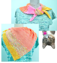
TALK TO THE PAW